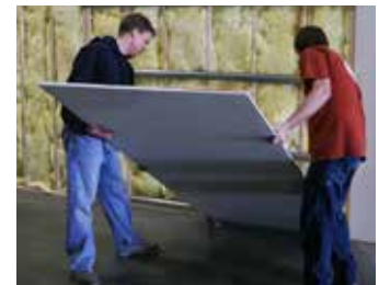
Step 3: Raise the drywall into place