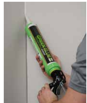
Step 4: Fill gaps between drywall

DISCLAIMER: Because of the many installation variables beyond our control, Green Glue Company shall not be liable for incidental and consequential damages, directly or indirectly sustained, nor for any loss caused by application of these goods not in accordance with current printed instructions or for other than the intended use. Our liability is expressly limited to replacement of defective goods. Any claims shall be deemed as waived unless made in writing to Green Glue Company within thirty (30) days from the date it was discovered, or reasonably should have been discovered.