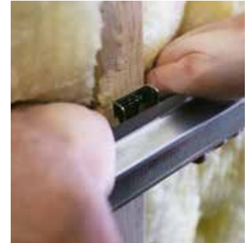
Step 2: Snap hat channel into clips

Scan QR code to see how to apply the Green Glue Noiseproofing Clip.